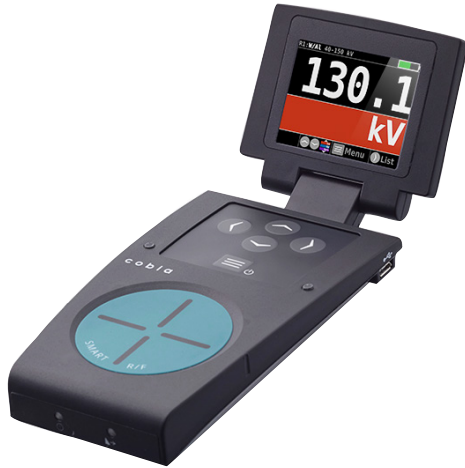
Cobia SMART R/F